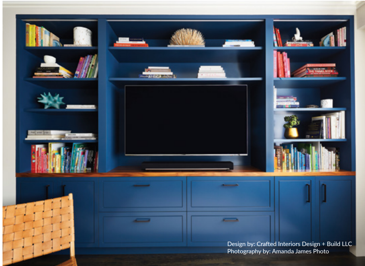
Design by: Crafted Interiors Design + Build LLC