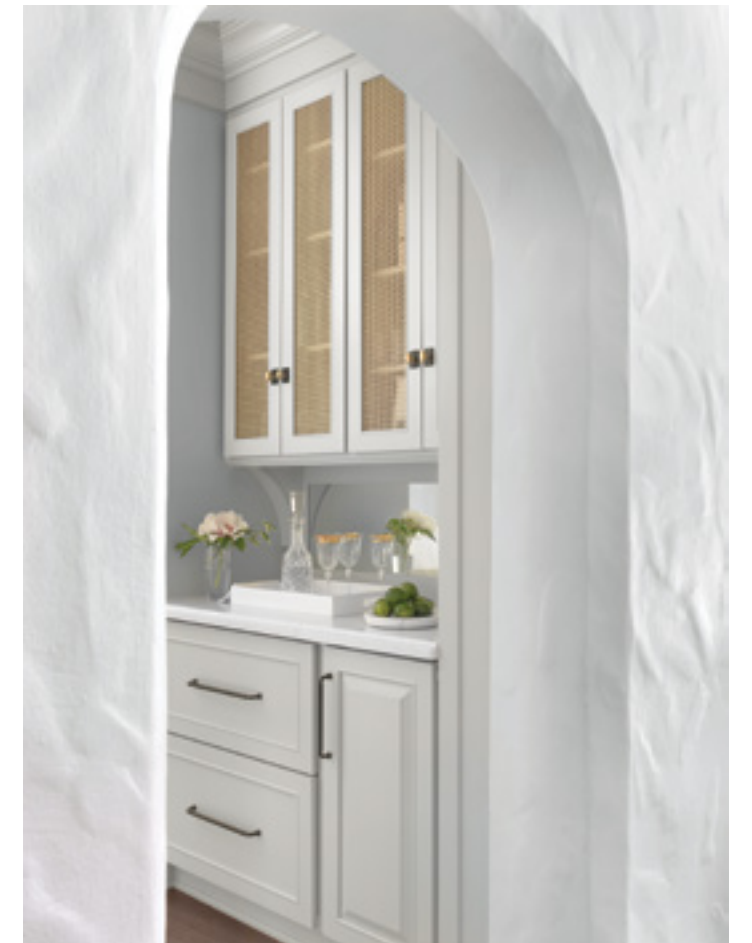
Door Style: Custom Finish/Material: Custom Paint Color Wood/Substrate Type: PGM